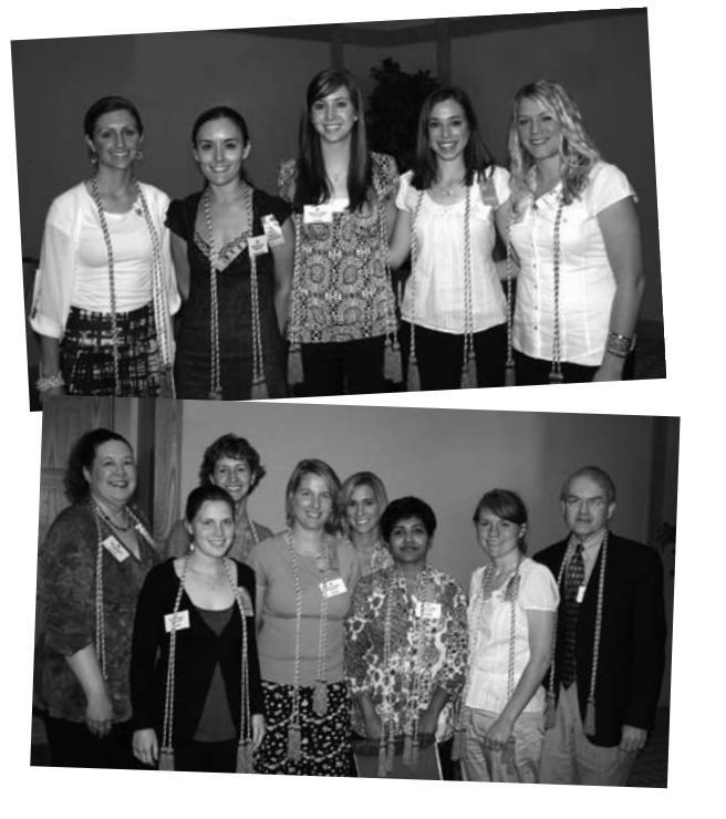
Top: Current UC Nursing seniors (inducted last Spring as juniors)

Bottom: Accelerated students inducted last Spring and now graduated